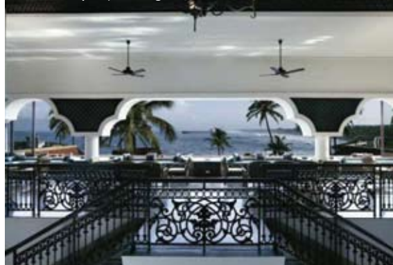
Vivanta by Taj Fort Aguada Beach Resort