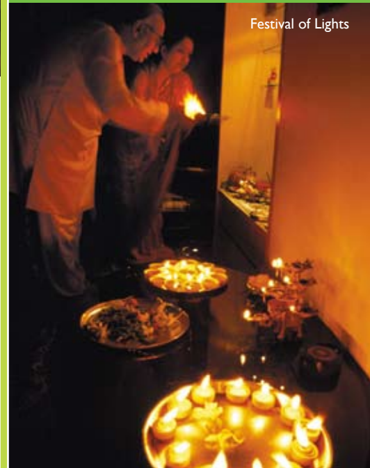
Festival of Lights

*Tour Price include all air within India. Worldview Tours is happy to assist you with your international air arrangements. Call them at 1-800-373-0388 for more details.