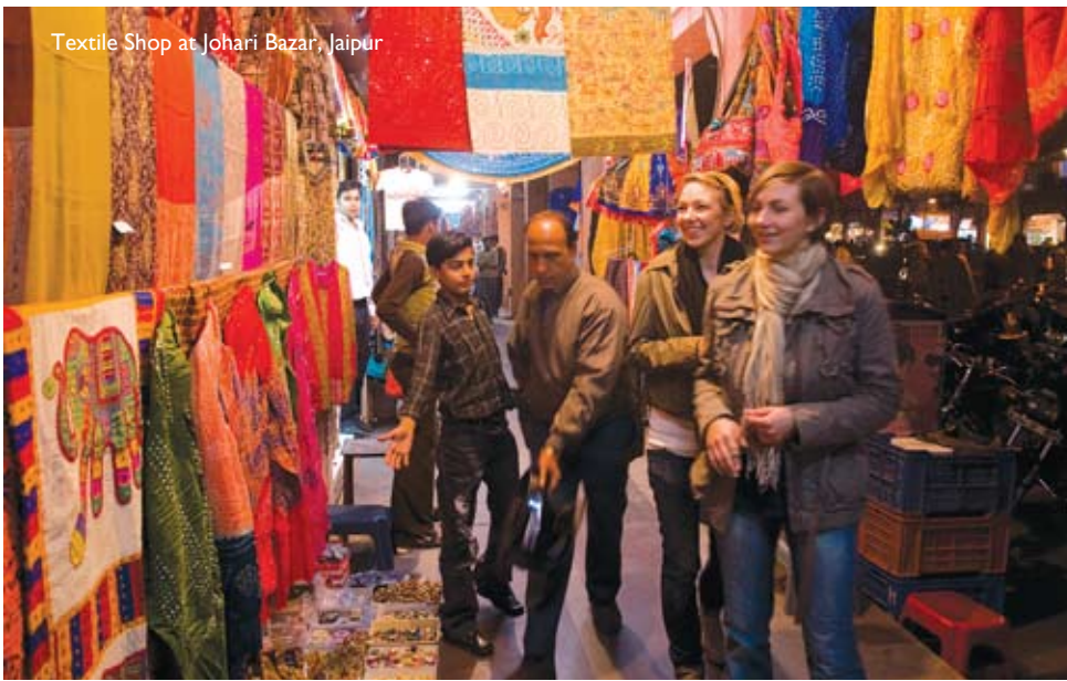
Textile Shop at Johari Bazar, Jaipur